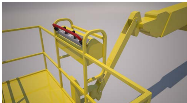
Figure 2 Examples of secondary guarding devices

For information about restraint systems used in arboriculture and forestry, refer to the HSE leaflet Mobile elevating work platforms (MEWPs) for tree work AFAG403 .