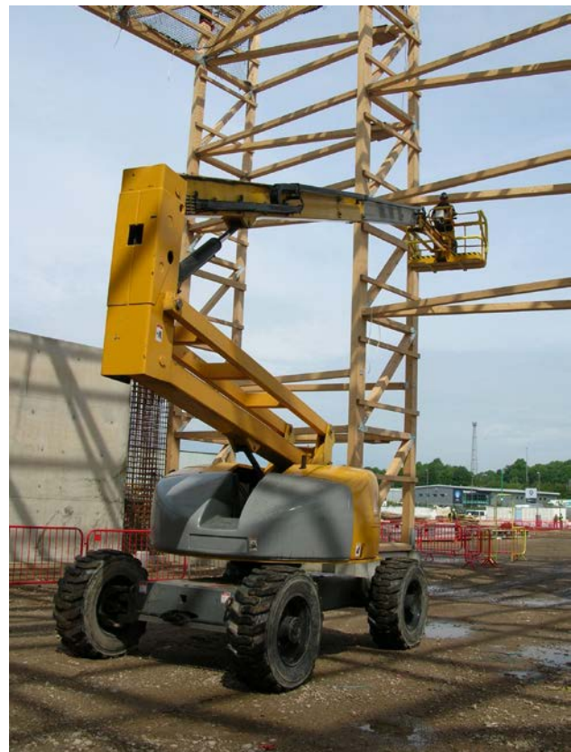
Figure 1 Operating a MEWP near overhead structures

focuses on minimising the overturning risks associated with mobile work equipment such as MEWPs. This is particularly relevant when considering the ground, environmental and operating conditions that the MEWP may experience.