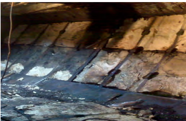
Figure 2. A shipboard confined space undergoing repair. It contains foam insulation, which can present a fire hazard.