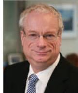
Rt. Hon. Lord Smith of Finsbury Chairman, Environment Agency