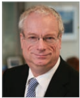
Rt. Hon. Lord Smith of Finsbury Chairman of the Environment Agency