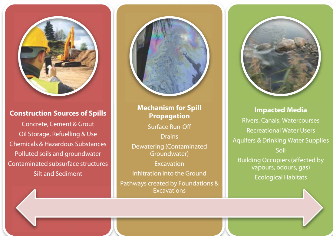
Figure 1: Sources, propagation and impacts of pollution spills

Many construction projects take place on brownfield sites where soil and groundwater are contaminated from historic land use, relict structures can hold contamination