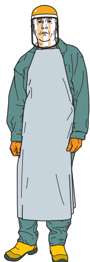
Figure 2 Operators must wear suitable PPE