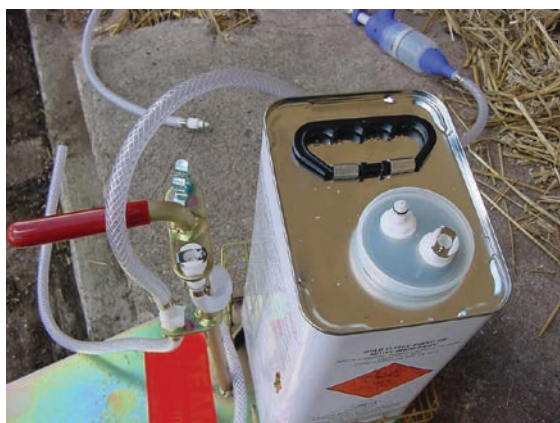
Figure 5 CTS dispensing kit