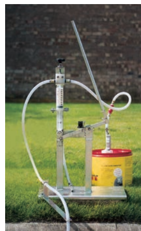
Figure 3 Always use a closed transfer systems for OP dips