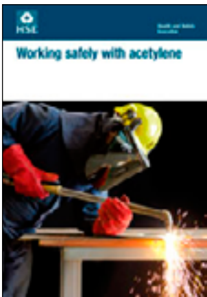
This is a web-friendly version of leaflet INDG327(rev1), published 07/14