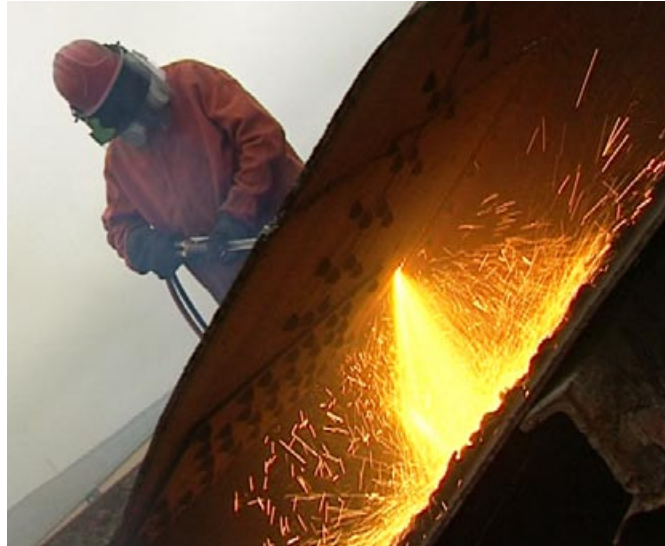
Figure 2 Cutting up scrap

If a welding blowpipe or burner is used on a tank or drum containing flammable material (solid, liquid or vapour), it can explode. Such explosions have killed people. As well as flammable liquids such as petrol, diesel and fuel oil, substances such as paints, glue, anti-freeze and cleaning agents may also release flammable vapours.