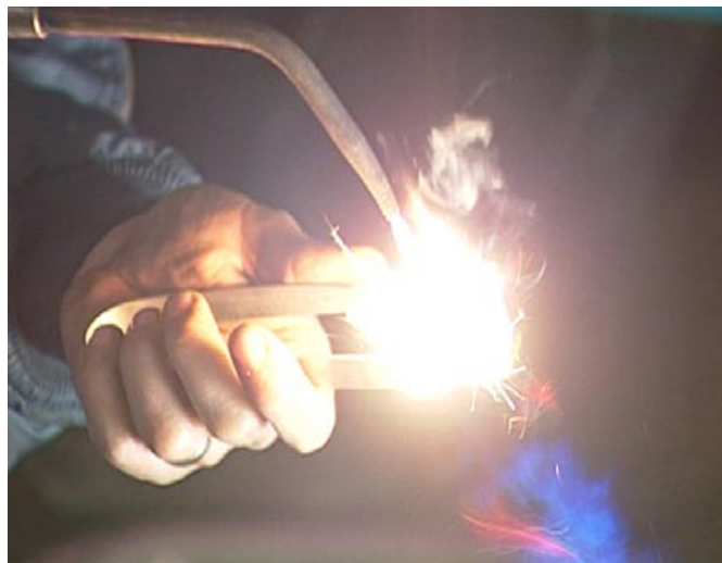
Figure 3 Spark ignitor

Flashbacks are commonly caused by a reverse flow of oxygen into the fuel gas hose (or fuel into the oxygen hose), producing an explosive mixture within the hose. The flame can then burn back through the torch, into the hose and may even reach the regulator and the cylinder. Flashbacks can result in damage or destruction of equipment, and could even cause the cylinder to explode.