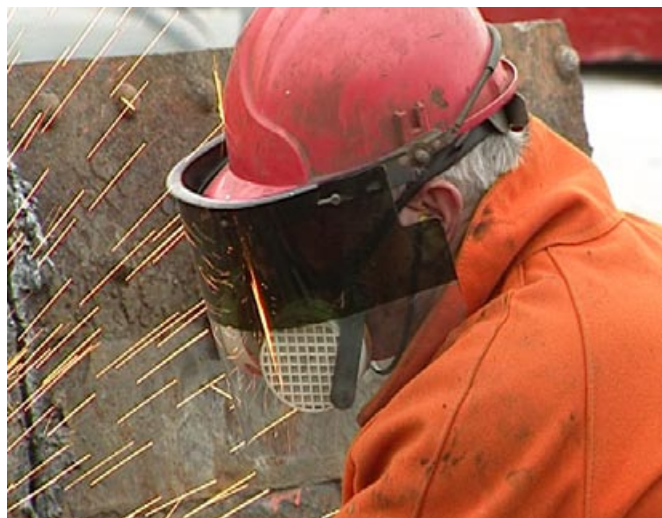
Figure 4 Visor and RPE

The fume from welding and flame cutting metals is harmful. You may need fume extraction and/or filtering respirators (respiratory protective equipment or RPE) to reduce the risk of ill health.