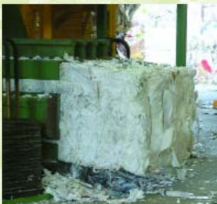
A strapped bale being ejected