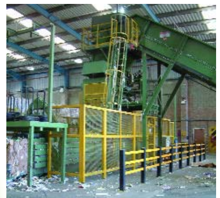
Guarded needlepit, bale ejection mechanism, access ladder to top of conveyor, and platform. Note barrier protection to prevent vehicles striking baler and conveyor