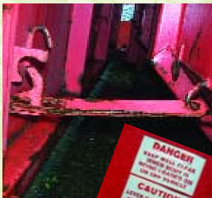
Typical restraining system fitted to container and safety stickers