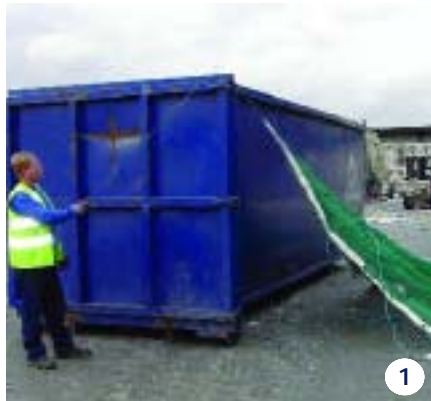
Throw and hook rope over bin

If sheeting has to be done from the ground follow these five easy steps: