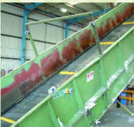
Pull cord at both sides and across the top of the conveyor feeding the baler