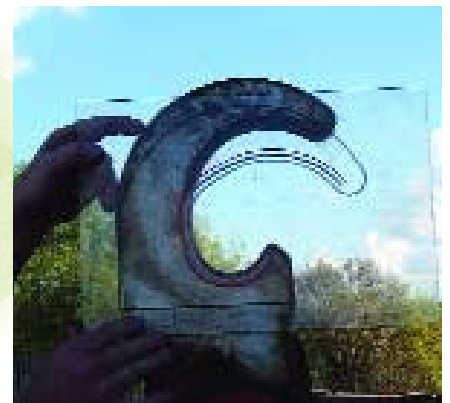
Hook profile showing stretched hook