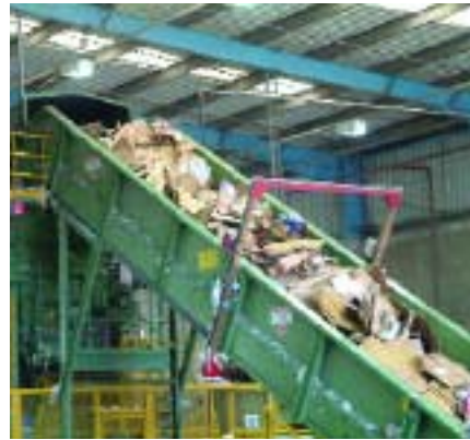
Waste travels up the inclined conveyor to the hopper

The paper to be baled drops (from the conveyor where fitted) into a compaction chamber, and the bale is ejected after passing through a wire-tying mechanism. These machines need regular preventive maintenance to ensure the integrity of all hydraulics, air systems, structural supports/fascia, guarding, and other safety equipment, especially emergency stops and isolators.