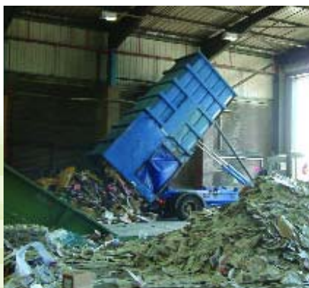
Paper and card is typically collected in bins, cages skips etc and transferred to specialist recycling sites for processing

Loading, unloading and tipping recovered paper involves using a variety of vehicles, including curtain-siders, flatbeds, tail-lifts, mobile compaction vehicles and purpose-built vehicles fitted with skips/containers. Skip/container handling vehicles may use chains, cables or hook-lifts to load, tip and unload containers.