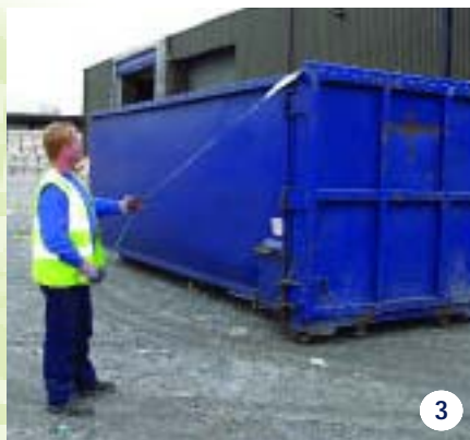
Pull sheet over opposite end of bin