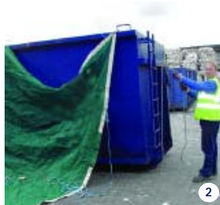
Pull sheet across bin