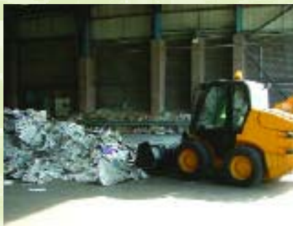
Moving material to the conveyor