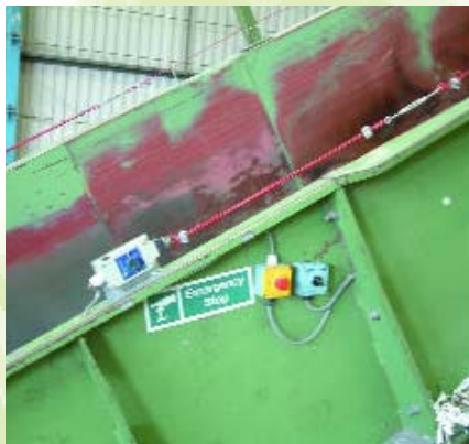
Emergency stop buttons at easily accessible locations fitted to the external framework