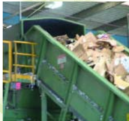
At the top of an inclined conveyor, material drops into the hopper and compaction chamber