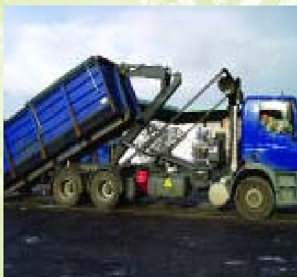
Part of a bin-exchange operation