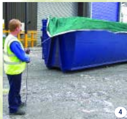
Pull sheet over front end of bin