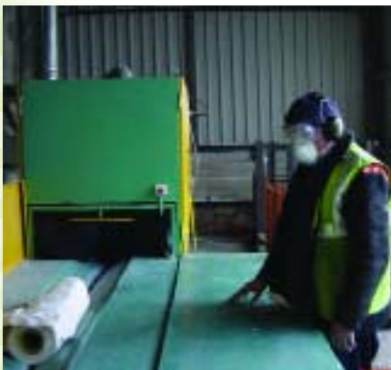
A well-guarded tunnel saw