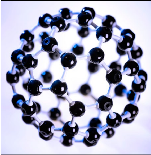
An example of a nanoparticle is a buckyball or fullerene.