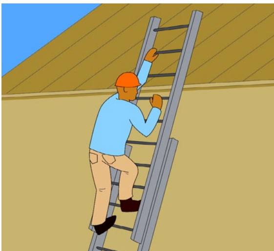
Figure 2: Ladder extending three feet above the landing area.