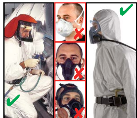
Figure 6 Only use air-fed breathing apparatus