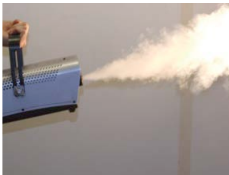
Figure 3 Party fog machine

The time ventilation takes to remove the paint mist is known as the 'clearance time'. Typically, a booth clears in less than 5 minutes, whereas a room can take 20 minutes or longer and you must know the clearance time for your spray booth or room.