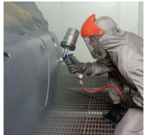
Figure 2 'Now you don't' Under normal booth lighting the mist is invisible

The paint mist is not, as is often imagined, instantly removed by the ventilation. The ventilation air is overwhelmed by the spray-gun air jet and the invisible mist builds up.