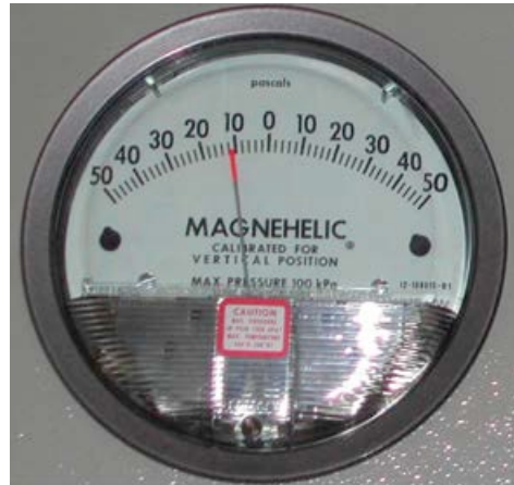
Figure 4 Example of a manometer fitted to a spray booth

Commercial vehicle (CV) booths are much larger and the clearance test will require an industrial smoke machine.