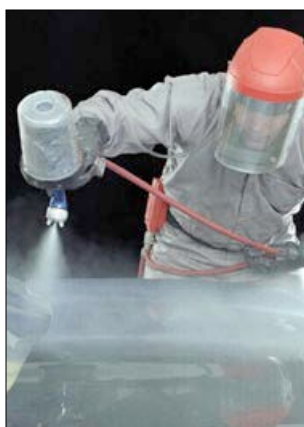
INDG388(rev2), published 2014