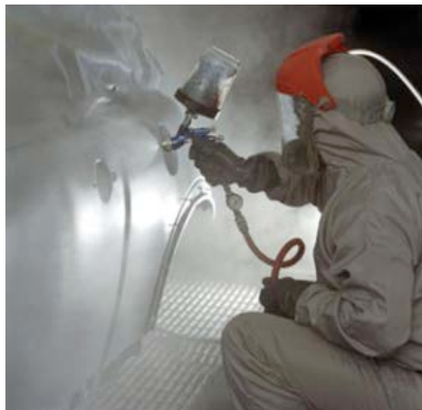
Figure 1 'Now you see it...' Special lighting and black background show paint mist enveloping sprayer

A paint spray gun creates a visible fan of paint, and large quantities of paint mist that is invisible under normal lighting. The mist quickly spreads through the whole spray enclosure, enveloping the operator. Special lighting can show up this mist.