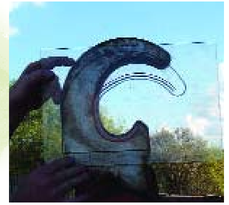
Hook profile showing stretched hook