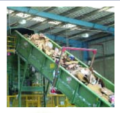
Waste travels up the inclined conveyor to the hopper

The paper to be baled drops (from the conveyor where fitted) into a compaction chamber, and the bale is ejected after passing through a wire-tying mechanism. These machines need regular preventive maintenance to ensure the integrity of all hydraulics, air systems, structural supports/fascia, guarding, and other safety equipment, especially emergency stops and isolators.