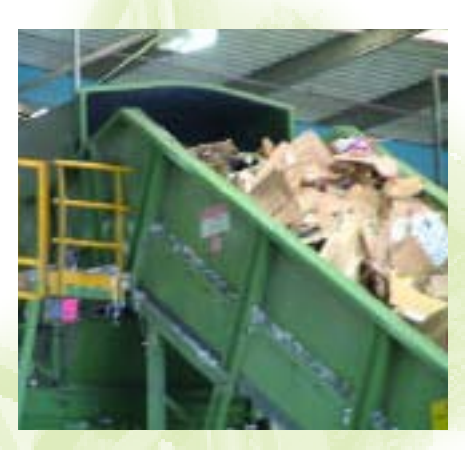
At the top of an inclined conveyor, material drops into the hopper and compaction chamber