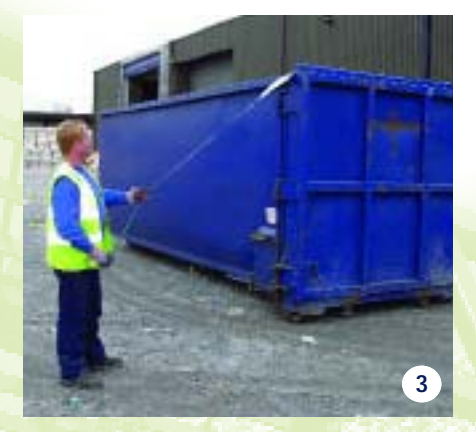
Pull sheet over opposite end of bin