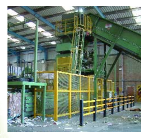
Guarded needlepit, bale ejection mechanism, access ladder to top of conveyor, and platform. Note barrier protection to prevent vehicles striking baler and conveyor