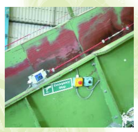
Emergency stop buttons at easily accessible locations fitted to the external framework