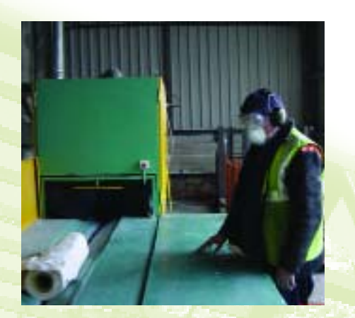
A well-guarded tunnel saw

Hand-held circular saws are used to split or 'slab off' paper broke from large reels, separating paper from the central core (if present), and aid baling by reducing the reel size. Methods include 'free hand' splitting, where the operator holds a circular saw to complete the task and 'fixed frame' splitting, where a circular saw is mounted on a fixed frame (fitted with dust extraction) and pushed along a rail by the operator at the desired height. Operators often stand on top of cut paper to continue splitting the reel, creating instability and a risk of falls.