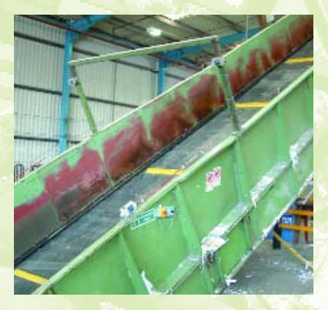
Pull cord at both sides and across the top of the conveyor feeding the baler